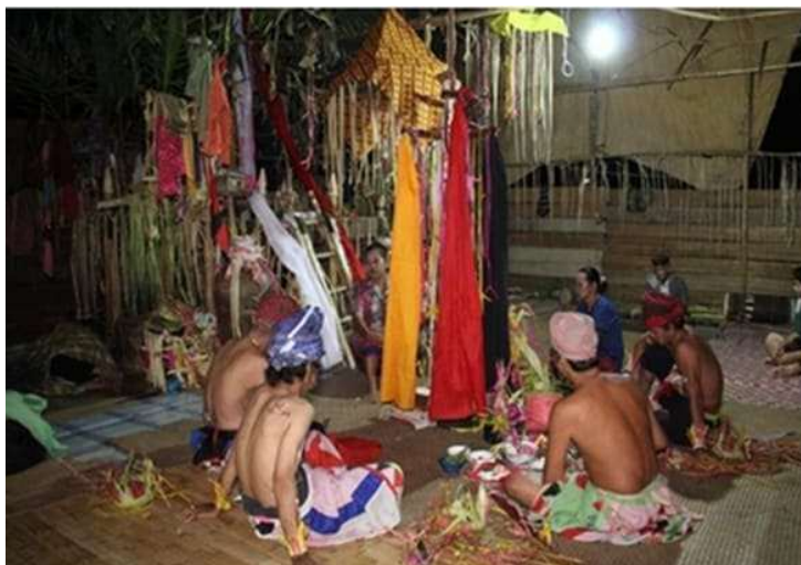
Figure 2. Customary Oath of Muara Tae Village

consistency over the recognition of customary rights. Disappointment with the formal legal process has prompted the indigenous people of Muara Tae to reactivate customary mechanisms to articulate their claims and express their distrust of the state. The implementation of customary oaths has become an important symbol in the dynamics of this conflict. This ritual is not merely a spiritual practice, but a form of moral delegitimization of the state's administrative decisions. Through the customary oath, the community affirms that its claims have a moral and social basis that transcends administrative legality. This action shows that the conflict has shifted from the administrative to the symbolic and existential realms.