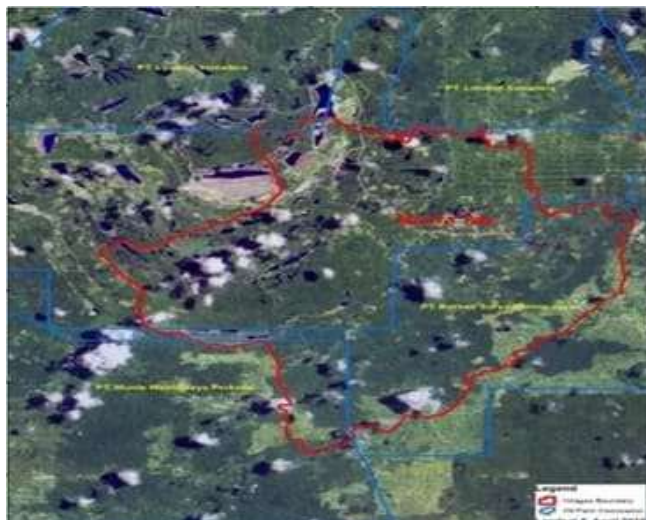
Figure 5. Satellite image of the Utaq Melinau customary forest

The spatial configuration of this area can be observed through satellite imagery, as shown in Figure 5. The image shows the forest cover structure of Utaq Melinau and the surrounding area, including indications of vegetation fragmentation and land use changes at the edge of the area. Visual analysis reveals a shift in the landscape that aligns with policy dynamics and land-use activities around the disputed area. This spatial representation not only serves as a geographical illustration but also as empirical evidence of spatial transformation that has become the locus of conflict. In this study, satellite imagery serves an analytical function, reinforcing field findings on shifts in access and discrepancies between customary claims and formal administrative boundaries. This spatial data serves as a verification tool for historical narratives and informant interviews that indicate changes in control and access to parts of customary forests. Thus, the customary land conflict in Muara Tae Muara Ponaq can be understood as the result of an interaction between genealogically based constructions of customary space and administratively based state territorial policies. The integration of historical data, interviews, observations, and satellite image analysis reinforces the view that this dispute is not only about boundary delimitation but also a structural consequence of the meeting of two distinct spatial legitimacy regimes.