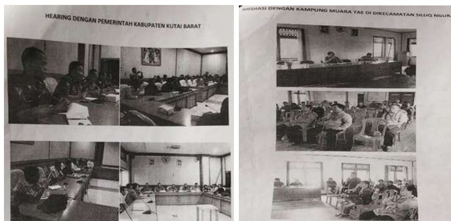
Figure 6. Documentation archives of mediation at the West Kutai regent's office and in Siluq Ngurai subdistrict, with representatives from both villages