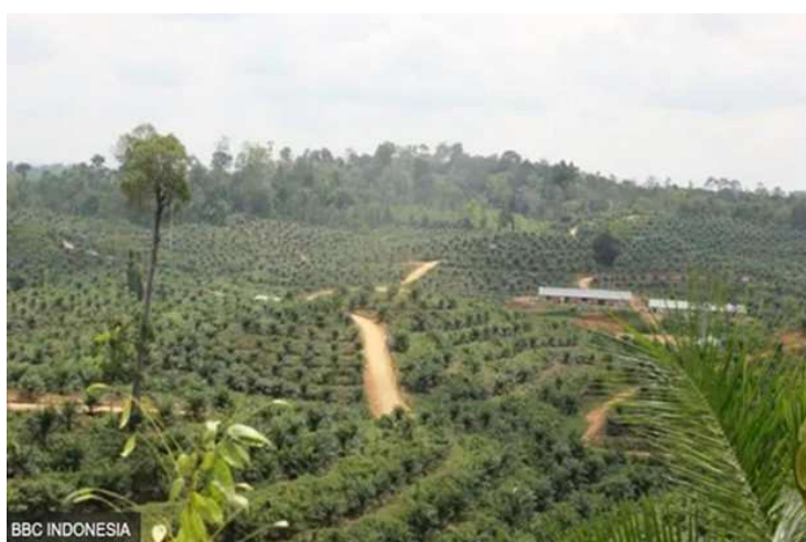
Figure 3. Oil palm plantations around the customary forest (2015)

The documentation of the customary oath reflects a crisis of trust in the state and serves as a form of moral legitimacy for customary land claims. The ritual confirms that the conflict has extended beyond a debate over administrative boundaries and now touches upon collective identity, community dignity, and the sustainability of indigenous peoples' living spaces (F. W. Indonesia, 2017). In this context, customary law emerges as an alternative source of authority that challenges the dominance of state law. At the same time, this customary land conflict occurs alongside a process of ecological degradation in the Utaq Melinau customary forest area. Changes in land use following the establishment of administrative boundaries indicate the expansion of oil palm plantations around the disputed territory. This transformation has not only altered the ecological landscape but has also shifted the economic structure and livelihood patterns of indigenous communities.