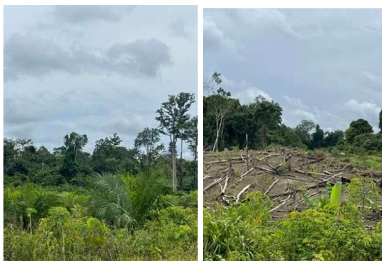
Figure 7. Condition of the Utaq Melinau customary forest in 2025

Field observation data from 2025, as shown in Figure 7, indicate significant changes in the ecological condition of the Utaq Melinau customary forest area. In this study, ecological degradation is defined as a decline in environmental quality characterized by reduced natural vegetation cover, changes in land use, and forest fragmentation. The visual documentation in Figure 5 shows land clearing and traces of land-use change toward plantation areas, indicating a spatial transformation from customary forest function to commercial economic function. Claims of ecological degradation are not assumptive, but are supported by direct observation, photographic documentation, and narrative confirmation from local informants. Triangulation between visual data and interviews shows that changes in land cover correlate with increased territorial tensions. Thus, customary land conflicts in this context are not only social and administrative in nature, but