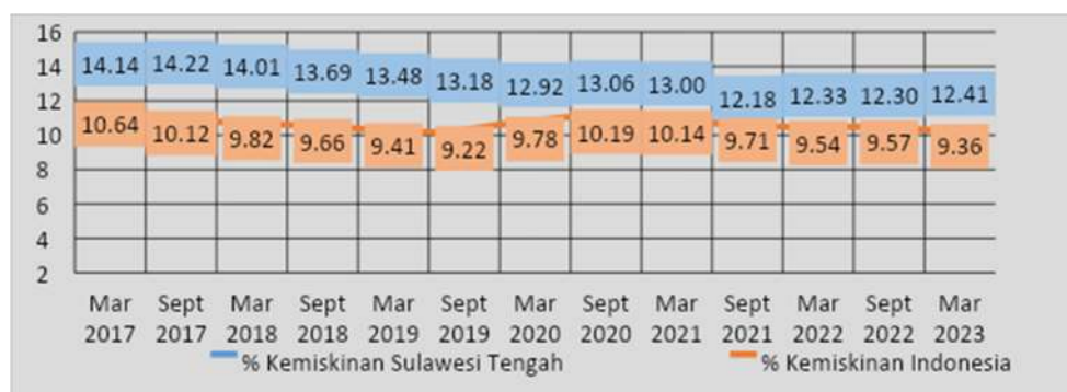
Figure 2. Poverty Rate