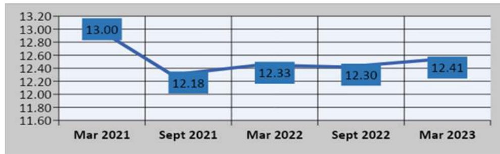
Figure 1. Poverty Rate (percentage)