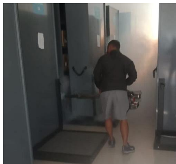
Figure 3. Fumigation Process in Archive Depot

Archive Depot regularly performs fumigation and inspects archive conditions to prevent damage caused by pests. Archive Depot currently carries out fumigation regularly to eradicate pests, such as insects, termites, and microorganisms that have the potential to damage archives.