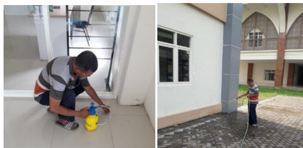
Figure 4. Disinfectant Spraying in Archive Depot

Spraying disinfectant liquid is carried out regularly to ensure the archive storage environment remains sterile and free from pests that have the potential to damage documents. Spraying disinfectant liquid is carried out to eradicate insect nests, such as ants and termites, in the archive storage rooms and around the Archive Depot building. The spraying activity is usually carried out with the assistance of a third party or pest control service.