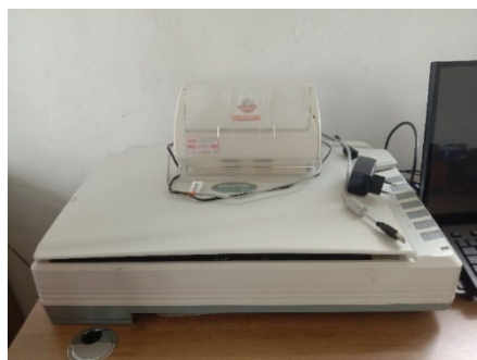
Figure 6. Scanner

Archives that have been through the media transformation process and changed into digital format were stored in the archiving system application owned by the Malang City Library and Archives Office. The archiving system application owned by Archive Depot is the e-Arsip application, which is an application developed through collaboration between Archive Depot and Kominfo of Malang City. Malang City Library and Archives Office also has an application and website for archives management in the form of photos, the National Archives Information System (SIKN) application, and the National Archives Information Network (JIKN) website.