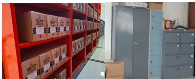
Figure 2. Roll Opack Storage & Fireproof Cabinets

Media storing textual archives in the Archive Depot is based on the Decree of the Head of ANRI Number 03 of 2000 concerning the Minimum Standards for Building and Rooms, which states that boxes used for storing archives must not be made of plastic. Boxes for storing archives are usually made of cardboard and coated with acid-free paper to prevent chemical reactions that can damage archives in the long term. Besides storage media, temperature and air humidity are the most important factors in preserving archives; instability of temperature and air humidity in archive storage rooms significantly impacts the quality of archives (Wati & Rahmi, 2021). Controlling the temperature of storage rooms aims to slow down the degradation process of archive materials, prevent mold growth, and avoid the potential of damage due to uncontrolled humidity. However, the technical constraints, such as a lack of temperature monitoring at night and the unavailability of a dehumidifier, indicate deviations from the ANRI standards (2015), as shown in Table 4.