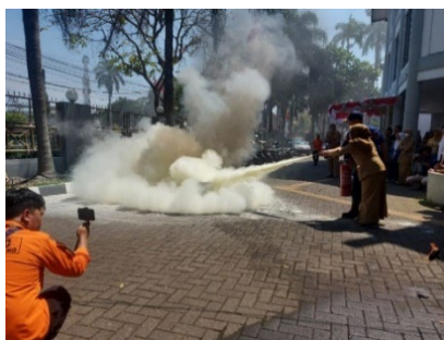
Figure 5. Disaster Emergency Mitigation Training

Disaster Planning consists of several steps: prevention, preparation, response, and restoration (Nurani & Christiani, 2019). Malang City Library and Archives Office has also provided all archivists and librarians with steps that must be carried out when facing a disaster, such as fire. Every archivist and librarian has participated in disaster emergency mitigation training with BPBD and the Malang City Fire Department.